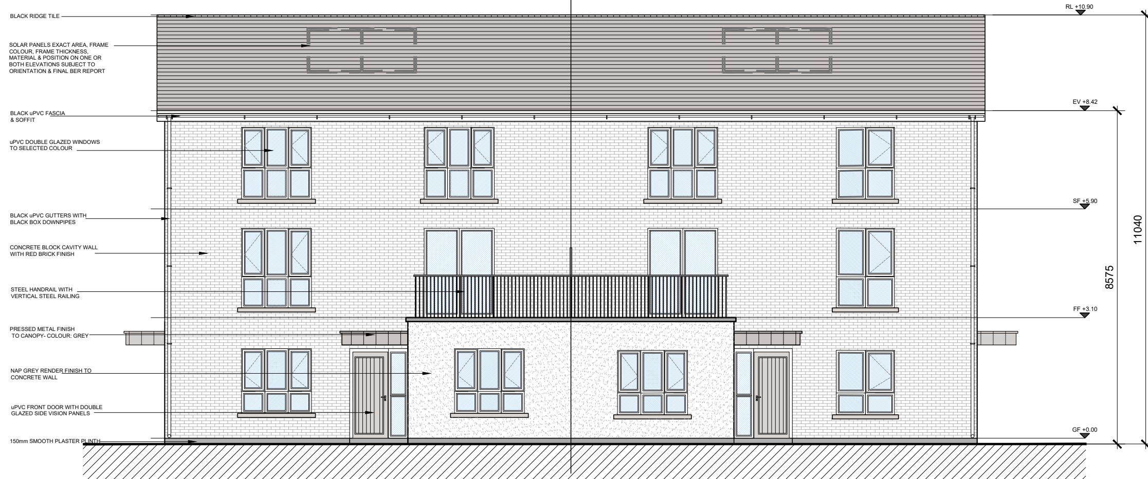
Front Elevation SCALE 1:100 @ A3

DO NOT SCALE. WORK TO FIGURED DIMENSIONS ONLY. ALL EXISTING DIMENSIONS TO BE CHECKED ON SITE. DRAWN ON AUTOCAD R2004 AT DEADY GAHAN ARCHITECTS LTD LAYERS ON THIS DRAWING COMPLY WITH BS 1192: PART 5