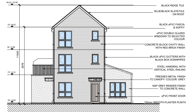
Side Elevations (G1/G3) SCALE 1:200 @ A3