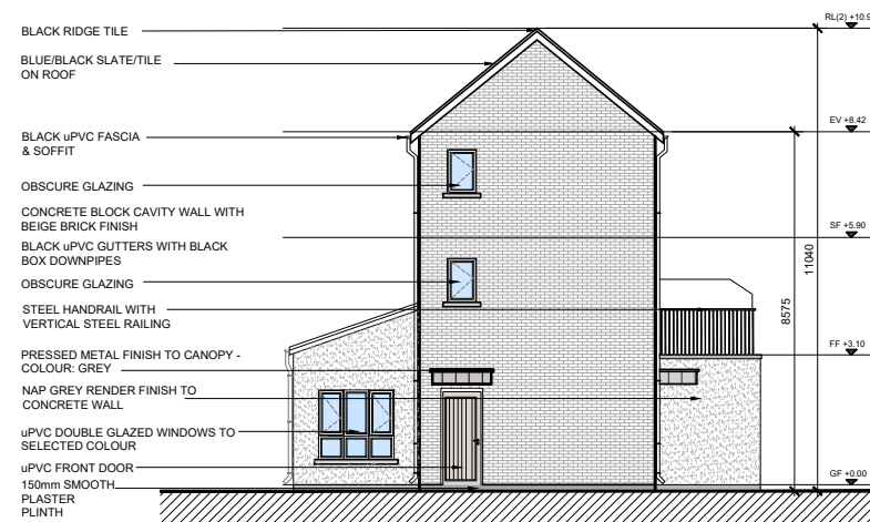
Side Elevations (G2/G4) SCALE 1:200 @ A3