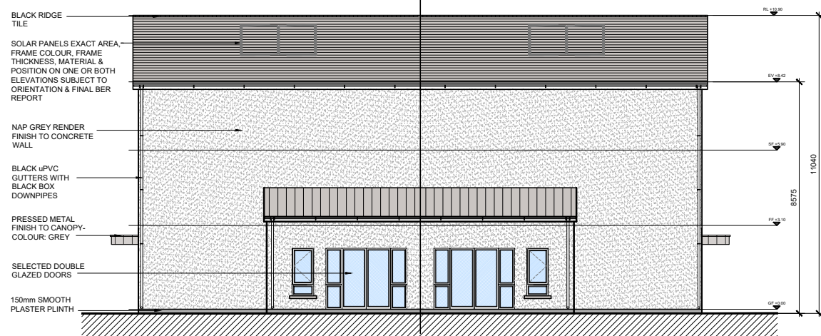
Rear Elevation SCALE 1:200 @ A3